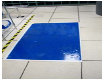
The Blue Peel-Off Tacky Mats

Bldg 8 threw approximately one ton (2028 lbs) of used plastic tacky mat sheets in the trash in 2009