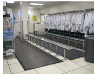
Building 8 Gowning Room with Dycem Floor Material

Dycem material was installed on November 27th, 2009